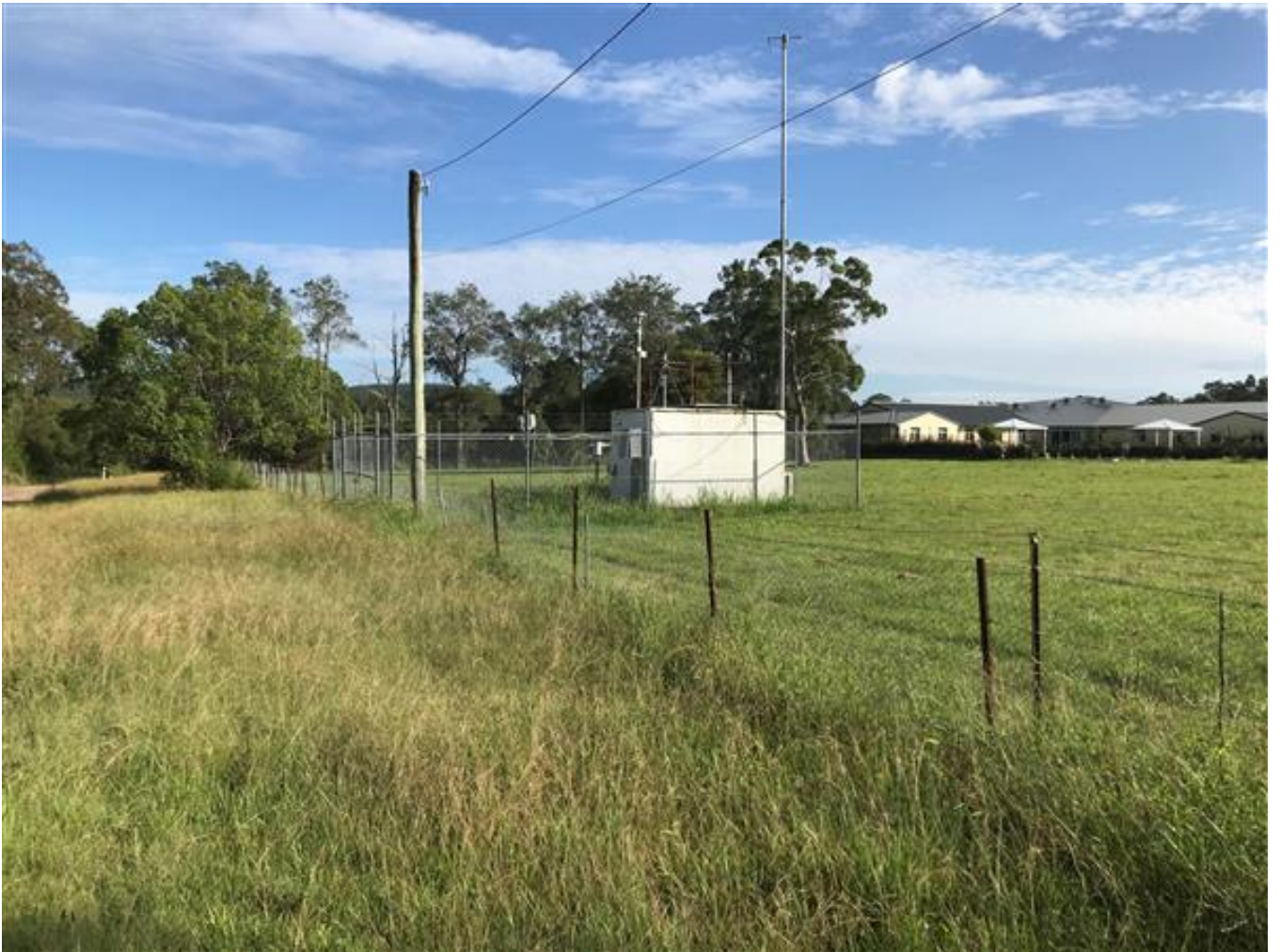
Delta's Meteorology Station located at Wyee